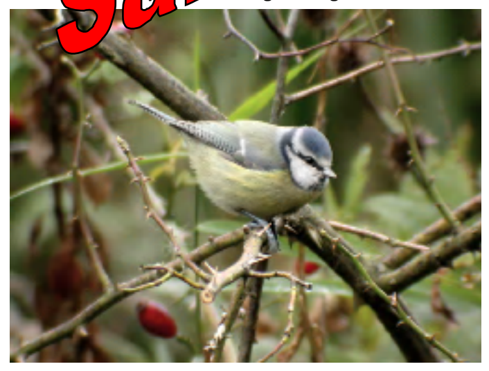
Plate 1. The attractive Blue Tit is one of our best-loved garden birds.

Although a pair of the risk of the little in the st, they did not attempt to build a nest, so I had to was the risk of the following of eeding season.